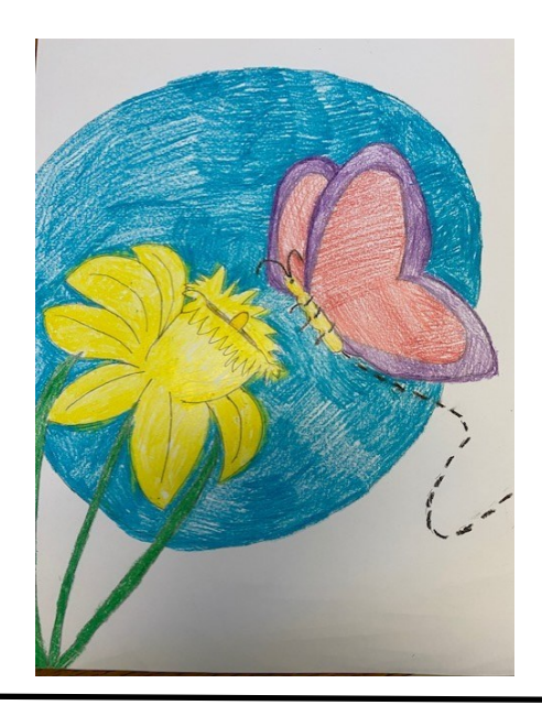
The beginning of spring By TW